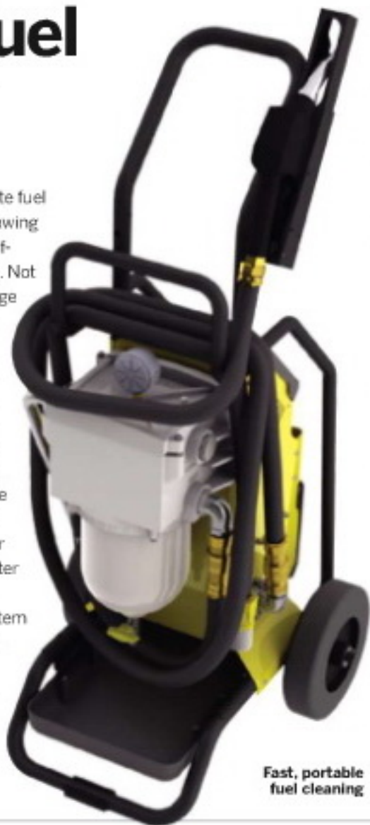
Fast, portable fuel cleaning