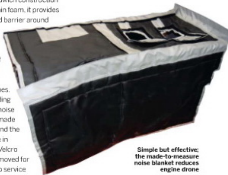
Simple but effective; the made-to-measure noise blanket reduces engine drone