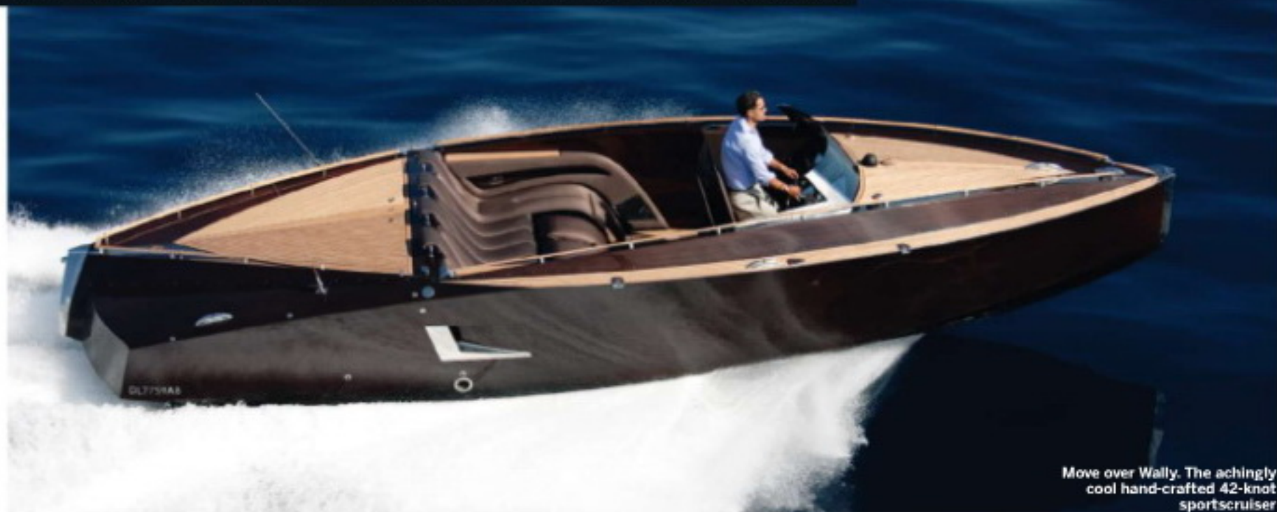
Move over Wally. The achingly cool hand-crafted 42-knot sportscruiser